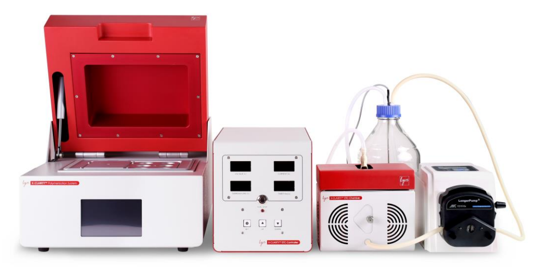
The X-CLARITY<sup>™</sup> Systems

In principle, the CLARITY method is the most compatible for FP imaging, but having to construct one's own electrophoresis chamber with a makeshift cooling system to prevent overheating is a challenge to most.